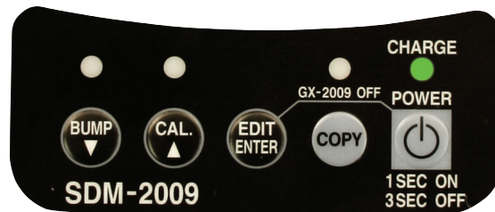
Control Panel View