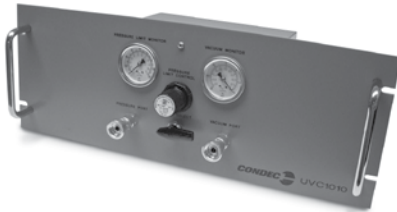
UVC1010, 19 inch wide rack-mount